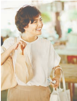
More home dwellers prefer to have conveniences such as shopping outlets within the same building.

Not every business has been shifted online or forced to close due to the pandemic. There a wide number of services that still need a business premise — salons, clinics and restaurants are just a few examples. Having them close to residential components is a huge benefit to business owner and residents, creating a sustainable synergy for