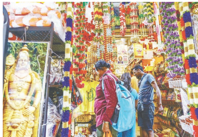
COLOURFUL ATTRACTIONS ...

theSun reached out to the council, Preakas, and Daiwa House Group on Jan 28 but has not received any response as of press time.