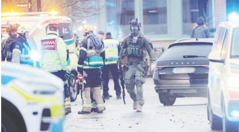
Emergency personnel and police officers at the school in Orebro on Tuesday.

The shooting took place some 200km west of Stockholm, at the