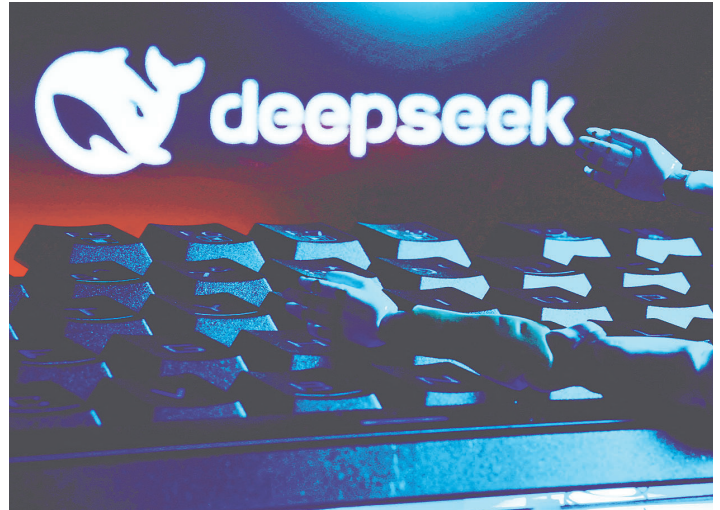
According to Bloomberg, DeepSeek's AI assistant topped the list of most downloaded mobile apps across 140 markets, with India accounting for the largest percentage of new users at the end of January.

battle that DeepSeek has to fight has already been launched. A widely circulated social media video describes an 83-hour digital war fought by DeepSeek staff and associates during the Chinese New Year period to deal with a large-scale cyber attack emanating from an unknown but highly sophisticated adversary based in the US using