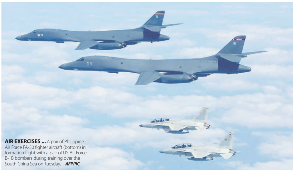
AIR EXERCISES... A pair of Philippine Air Force FA-50 fighter aircraft (bottom) in formation flight with a pair of US Air Force B-1B bombers during training over the South China Sea on Tuesday.

PRAYAGRAJ: Prime Minister Narendra Modi took a ritual river dip yesterday at the world's largest religious festival. Many millions of people have already bathed in the confluence of rivers at the Kumbh Mela, a six-week-long Hindu celebration of prayer and bathing held every 12 years. Modi, dressed in a saffron-coloured top and counting prayer beads in his hands, waded out thigh-deep to the holiest site of the Sangam, the meeting point of the Ganges, Yamuna and mythical Saraswati rivers. He then dunked his head under the waters several times. Modi said he was "blessed" to take part, calling it a "moment of divine connection". - AFP