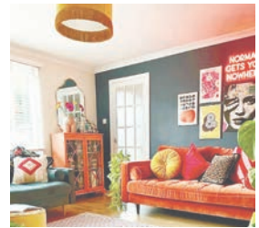
Personality-themed designs incorporate items that are meaningful to the owner.

Employing deep brown shades, such as walnut, adds depth while the use of wood adds a touch of luxury.