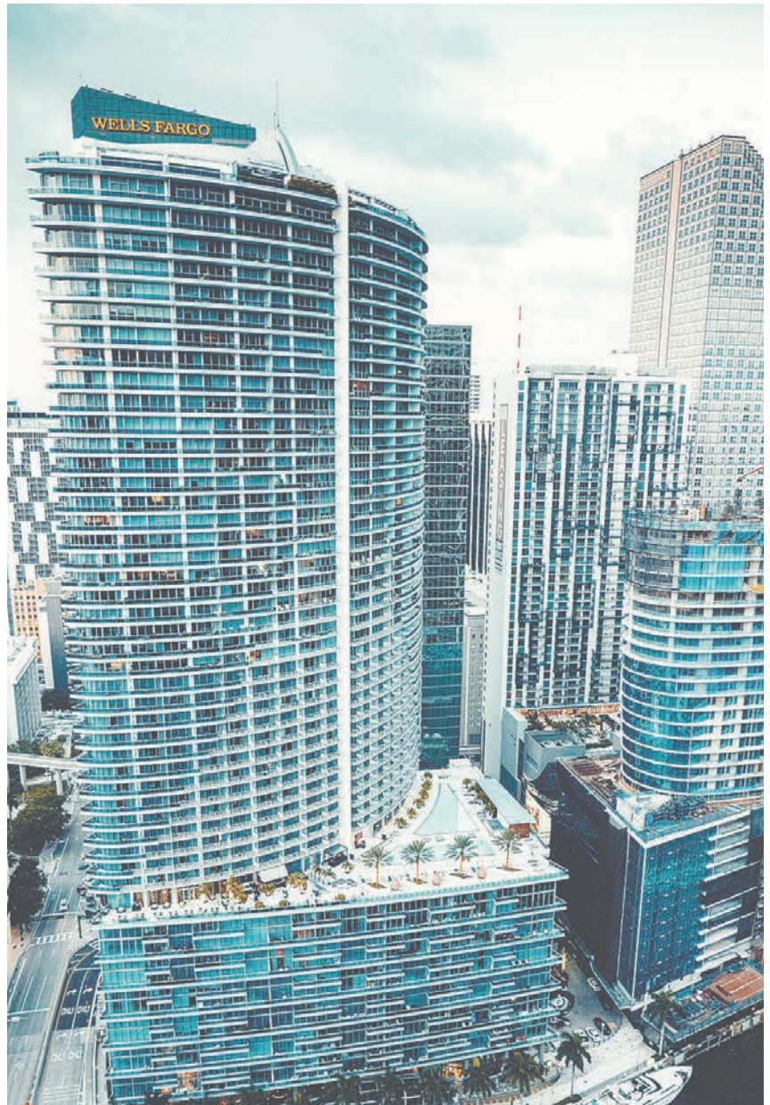
More high-rise projects are incorporating shopping, entertainment and lifestyle options within the same development.

These have seen a rise in developments, in which residents live, shop and find entertainment all within the same housing complex. If such conveniences appeal to you, then a residence in a vertical mixed-used building is ideal. Just a brisk walk without having to get into the car for all your daily need and more.