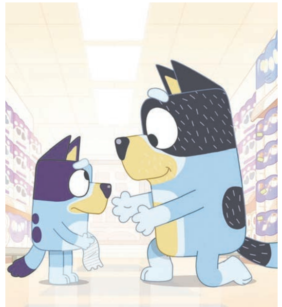
Australian animated series Bluey has clocked up 55.6 billion viewing minutes.

platforms. The medical series cements its position as a must-see programme. Over the last five years, the Shonda Rhimes creation has always been among the six most-