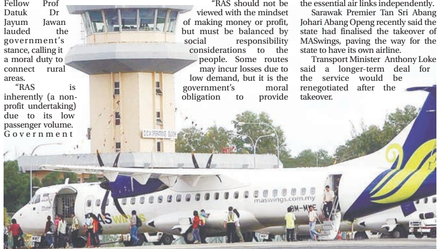
MASwings operates 40 RAS routes in Sarawak and Sabah.

Transport Minister Anthony Loke said a longer-term deal for the service would be renegotiated after the takeover.