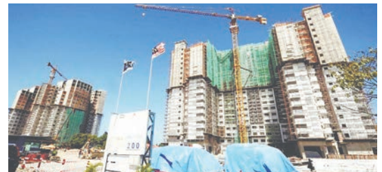
Digitalisation, sustainability, and urban living trends will define Malaysia's property market.

"In the commercial sector, despite supply pressure, 'flight-to-green' and 'flight-to-quality' trends will redefine the office and retail markets, creating a new narrative within the segment," he said, adding that the tone for 2025 is likely to be influenced by factors