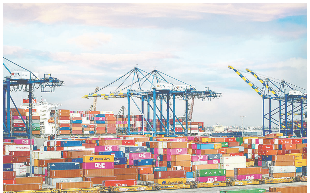
Malaysia should expand its free trade agreements by pursuing both bilateral and multilateral deals to boost economic resilience.