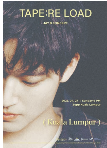
Jay B is the leader of South Korean band Got7.

Organised by Line Up Ent, tickets for the concert go on sale this Sunday.