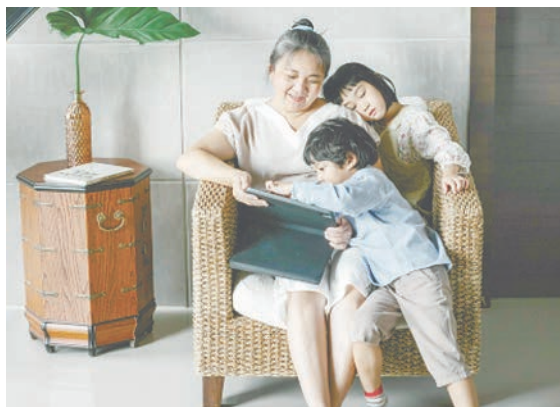
Nielsen says viewers across the globe cumulatively spent more than 12 trillion minutes watching streaming programmes in 2024.

with long-established programmes, often originating on traditional TV channels. In second place, Grey's Anatomy totalled 47.85 billion minutes watched on various