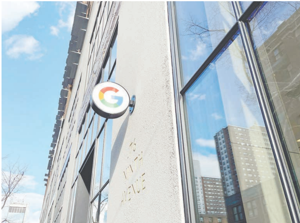
A Google Store, where visitors can try phones and other products from the company, in New York. – REUTERS/SPIC

Analysts were expecting a rise of 32.3% to $12.16 billion, according to data compiled by LSEG. – Reuters