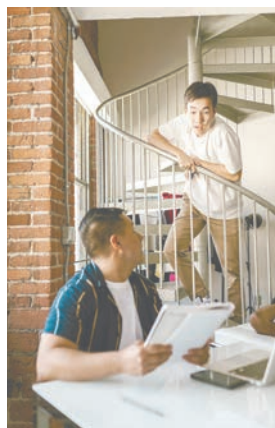
A large student population will boost a suburb's value as there will be high demand for rented premises.