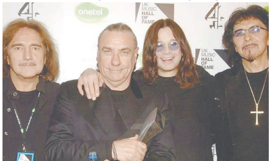
Black Sabbath is widely revered for its contributions to heavy metal.

"I am a proud Brummie from Aston through and through. I am still amazed to this day that no one outside of Birmingham can understand a word I say, but that has always made me laugh. My only regret is my mum and dad are not here to see what I became. Birmingham for ever!" he added. – by R.BALA