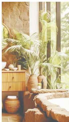
Biophilic design emphasises natural materials, wood furniture and ample daylight and space.