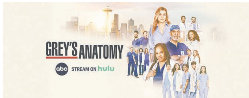
Over the last five years, Grey's Anatomy has always been among the six most-watched programmes on streaming.