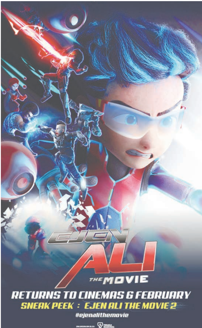
The re-release of the film in cinemas will feature a five-minute sneak peek of sequel Ejen Ali The Movie 2 .