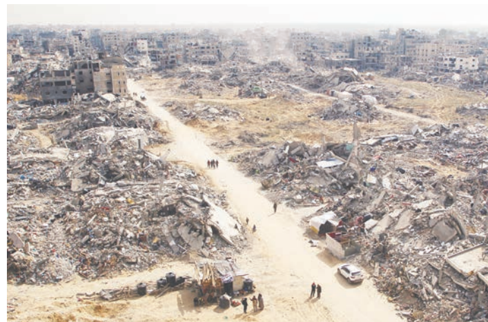
Palestinians walk past the rubble of buildings destroyed by the Israeli offensive in Rafah.

Palestinians want a state in the West Bank, East Jerusalem and Gaza Strip, all territories captured by Israel in the 1967 war with neighbouring Arab states. – Reuters