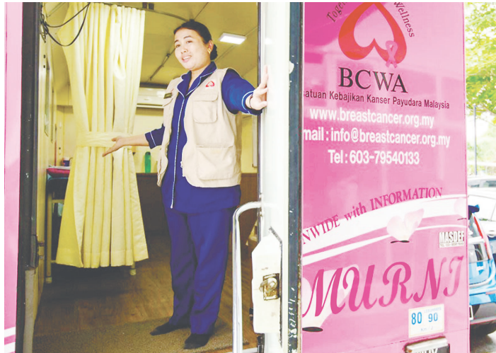
Sumitra said a staggering majority of breast cancer cases occur sporadically, with only 10% to 20% linked to family history.

"The NCSM is working with the Health Ministry to develop a national database to