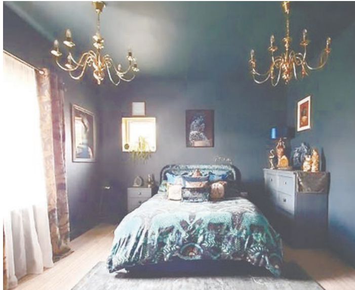
Colour drenching involves painting a room entirely in the same shade of an intense colour.

If you want to stand out, craft a design theme based on your own personality – something that communicates your personal story, traditions and culture.