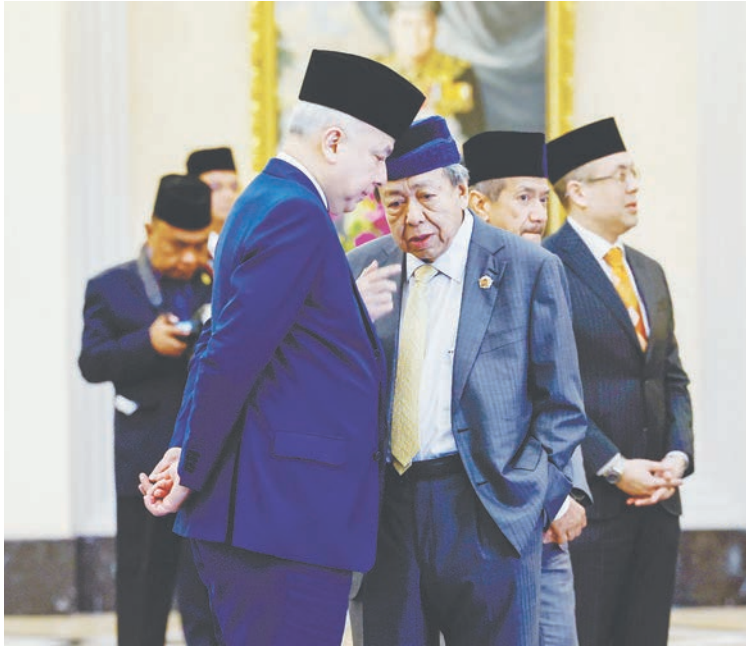
Sultan Sharafuddin and Sultan Nazrin at the Conference of Rulers in Istana Negara yesterday.

The last meeting of the Conference of Rulers was held in October, presided by Sultan Nazrin, who is also the Deputy Yang di-Pertuan Agong.