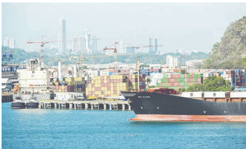
A cargo ship waiting at the port of Balboa before crossing the Panama Canal. – AFP/PIIC

CK Hutchison Holdings is one of Hong Kong's largest conglomerates, spanning finance, retail, infrastructure, telecoms and logistics. – AFP