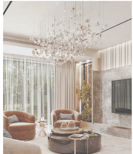
Earthy colours are visually soothing and comforting.