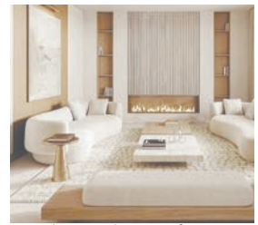
Japandi is a combination of Japanese and Scandinavian aesthetics.