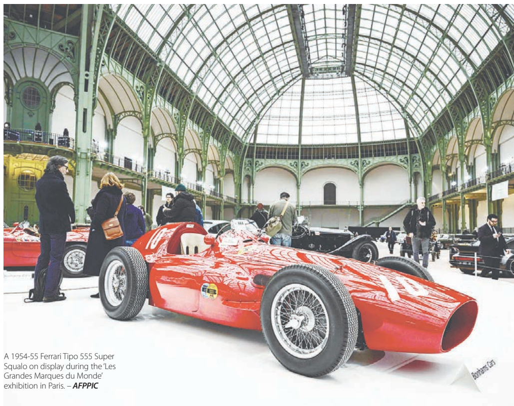
A 1954-55 Ferrari Tipo 555 Super Squalo on display during the 'Les Grandes Marques du Monde' exhibition in Paris. — AFP/IC

Any planned change to Ferrari's sales cap policy in China would be communicated at the capital markets day in October. — Reuters