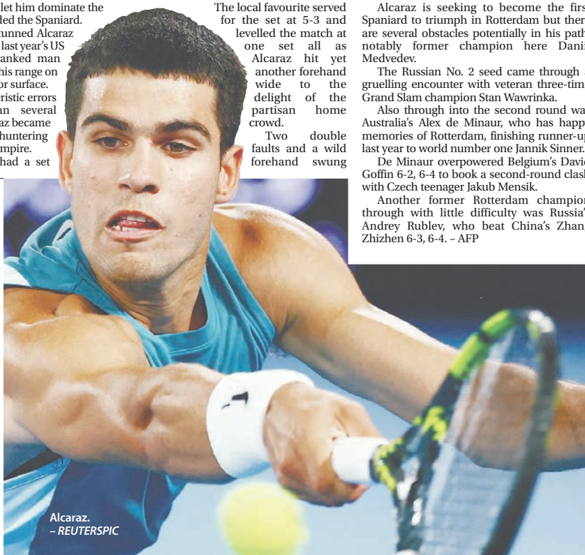
Alcaraz.

Another former Rotterdam champion through with little difficulty was Russia's Andrey Rublev, who beat China's Zhang Zhizhen 6-3, 6-4.